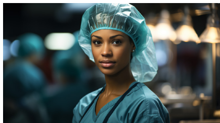
Surgical Preparation and Assisting