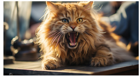
Animal Behavior and Restraint