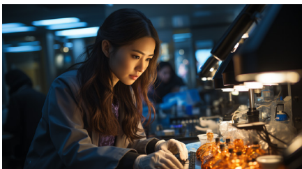
Lab Procedures and Diagnostic Imaging