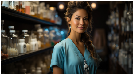
Pharmacy and Pharmacology