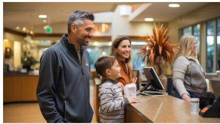
Communication and Client Relations