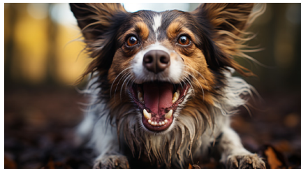
Exam Room Procedures